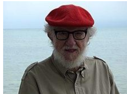
Reese Palley in 2010