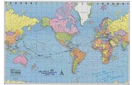
Unlikely VII circumnavigation 1979-1994